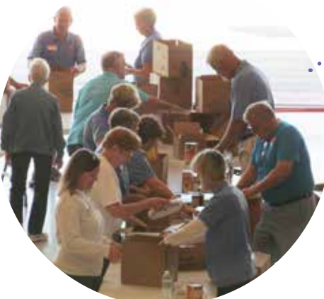
Volunteers from Palma Sola Presbyterian Church packing Thanksgiving boxes