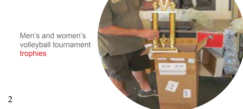
Men's and women's volleyball tournament trophies