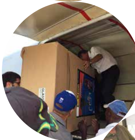
2 BIG basketball goals sent to Haiti